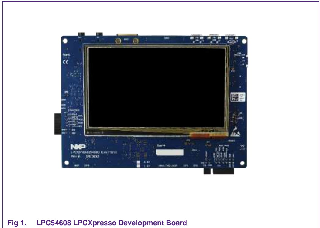
Fig 1. LPC54608 LPCXpresso Development Board

http://www.nxp.com/products/microcontrollers-and-processors/arm-processors/lpc-cortex-m-mcus/lpc54000-series-cortex-m4-mcus/lpcxpresso-development-board-for-lpc5460x-mcus:OM13092