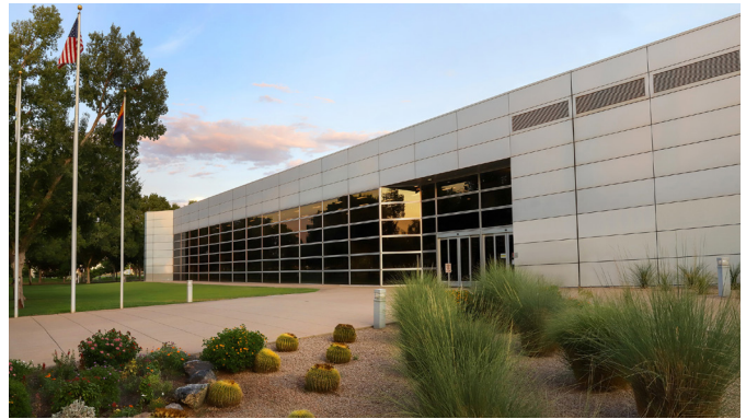
NXP's high-volume GaN manufacturing facility in Chandler, Arizona