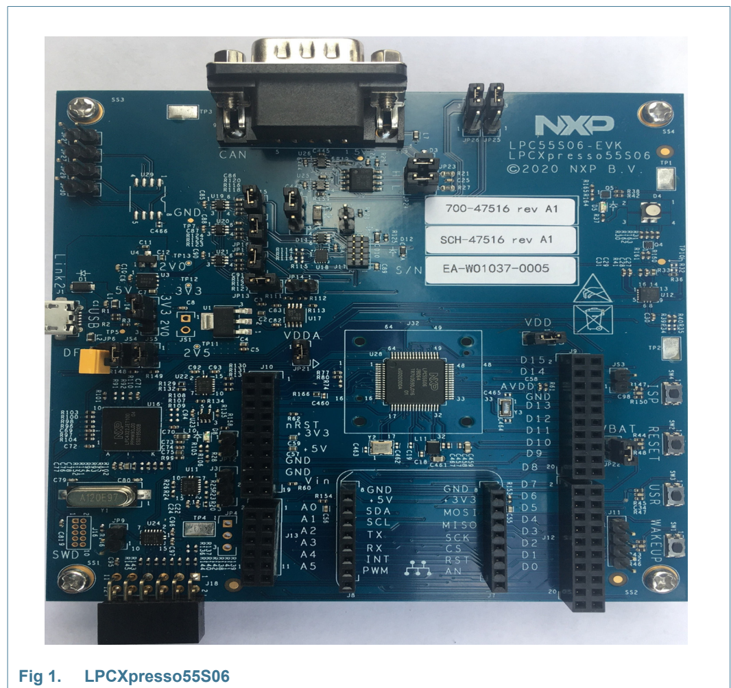
Fig 1. LPCXpresso55S06

See https://www.nxp.com/demoboard/LPC55S06-EVK for more information on these boards, including tutorial videos, development software and board hardware design files. The abbreviation LPC55S0x is used to collectively refer to the LPC55S0x/LPC550x family device on the board.